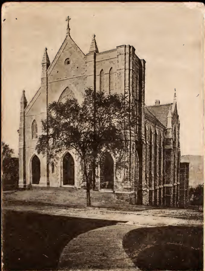
CHURCH OF THE ASSUMPTION, R. C., ANSONIA, CONN.